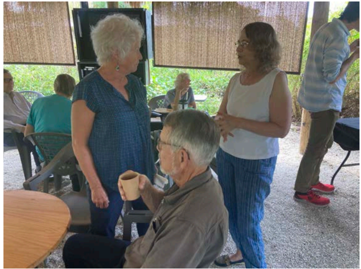
FtMMM Friends enjoy conversation following potluck, First Sunday of March.