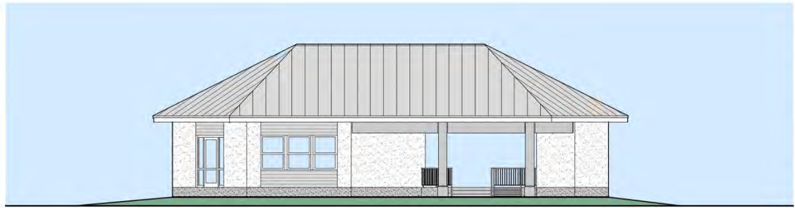
NORTH (ENTRY) ELEVATION

PARKER / MUDGETT / SMITH ARCHITECTS, INC. 2138 MACREGOR BLVD., FORT MYERS, FLORIDA 33901 (239) 332-1171 FRIENDS MEETING HOUSE 13-8-2022 A101