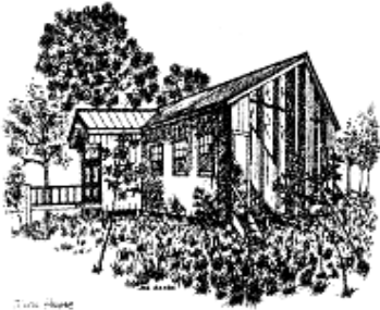
Iona House Calusa Nature Center