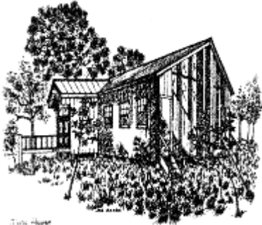
Iona House Calusa Nature Center