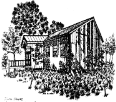
Iona House Calusa Nature Center