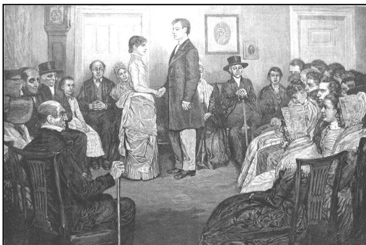
“QUAKER WEDDING” by Howard Pyle